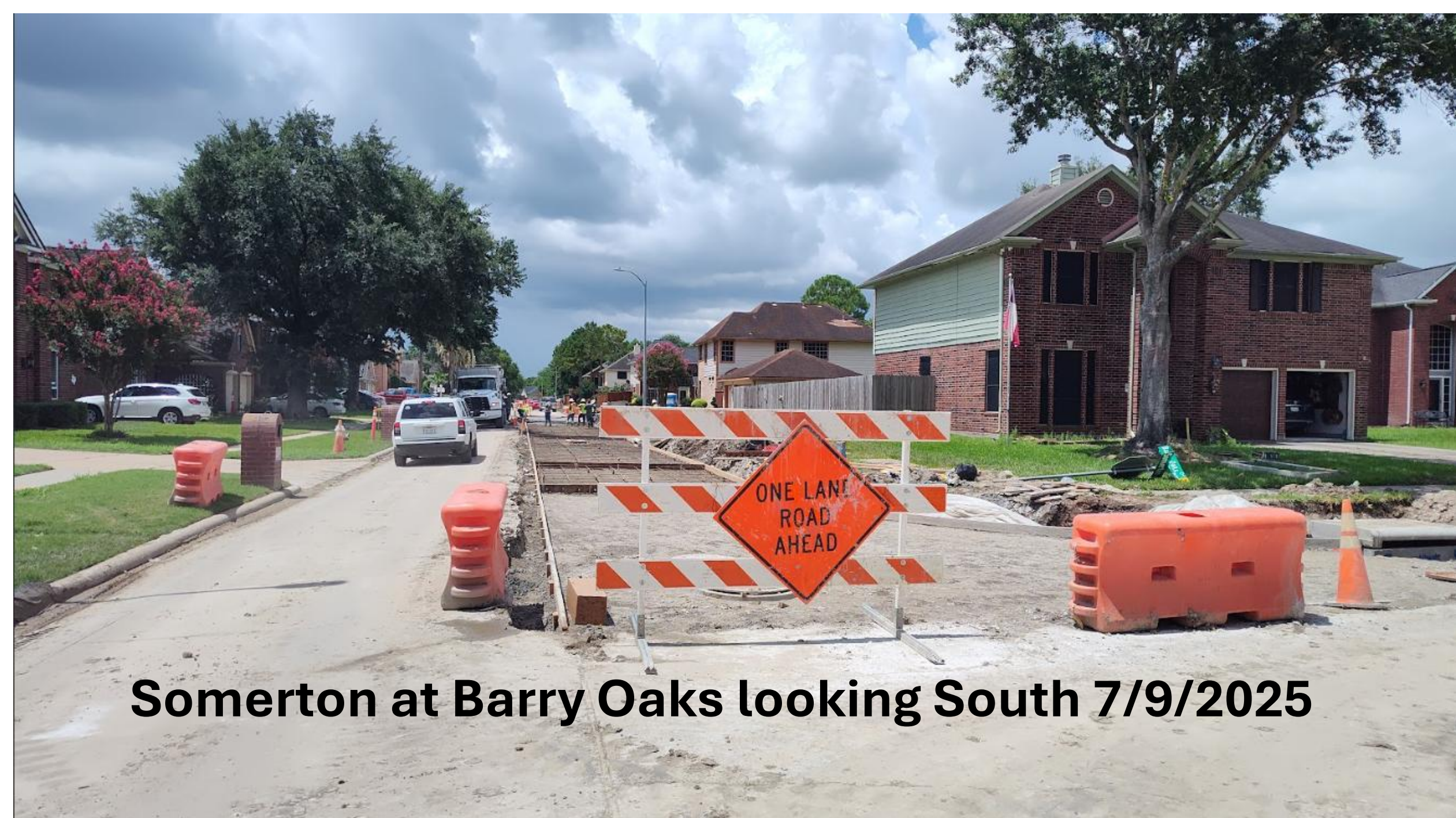
Somerton at Barry Oaks looking South 7/9/2025